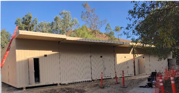
Building H Modular

This project consists of supplying and installing a new science portable. The portable will include biology and chemistry labs and a teacher's preparatory room. In addition, classroom F-606 will be remodeled into a science lab. Update: The remodel of classroom F-606 is complete. Mechanical, electrical and plumbing rough-in work is near completion in the modular building. Trenching under stairwell for new plumbing and electrical lines is complete.