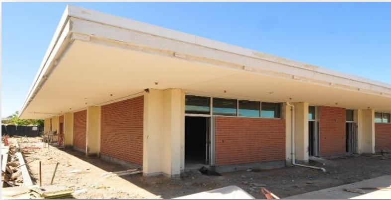
Exterior Construction Progress

The first phase of the Science, Math & Career Tech complex is the renovation of Building 31. Tenants of Building 31 are housed in the interim swing space located in Parking Lot No. 5 South. Update: Plaster installation is complete, and scaffolding has been removed. Grading and laying of base for concrete hardscape are ongoing. Concrete hardscape placement continues. In the interior of the building, preparation painting is underway. Completion is anticipated for October 2019.